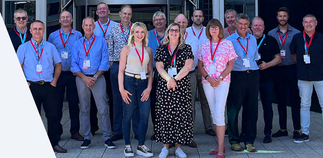
Appointed Representatives at a recent AR conference

Switch to Appointed Representative status with Fleet Alliance and that's all done for you, leaving you to focus on the customer, the consultation and the selling.